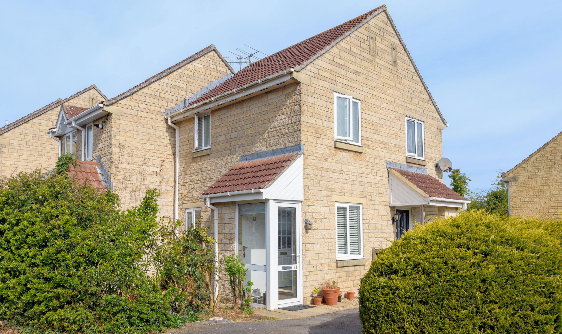
23 Mythern Meadow Bradford on Avon, Wiltshire, BA15 1HF